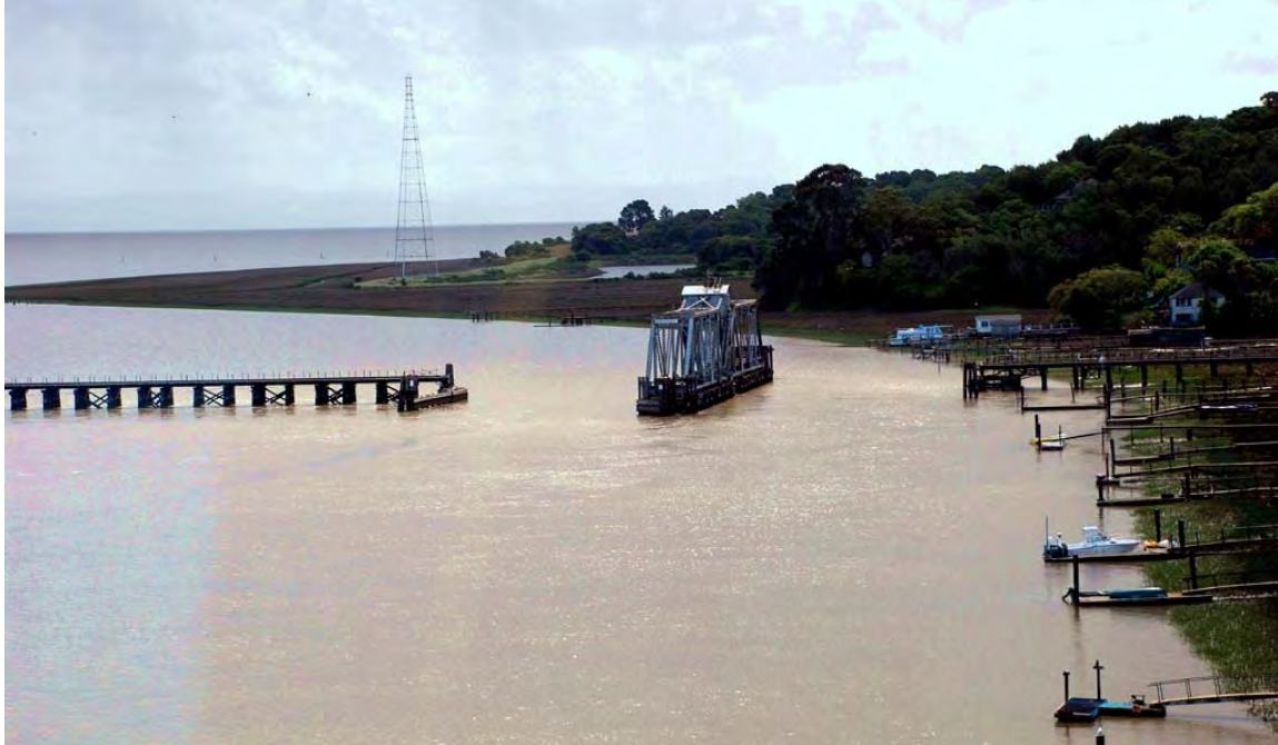
Are you REALLY ready? Make your mark by rounding this historic bridge, 13.1 miles downstream