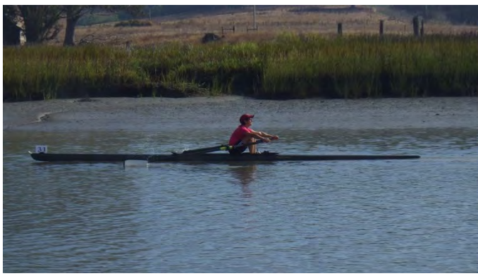
Seven miles into the race and still fabulous conditions