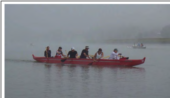
He'e Nalu keeping their cool as they chase Tamalpais OCC

Are you ready? Put yourself in the picture!