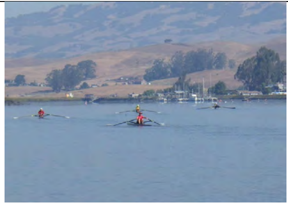
Homeward bound under the protection of Sonoma Mountain