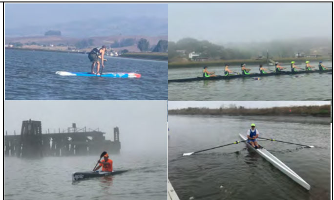
Everyone can play!