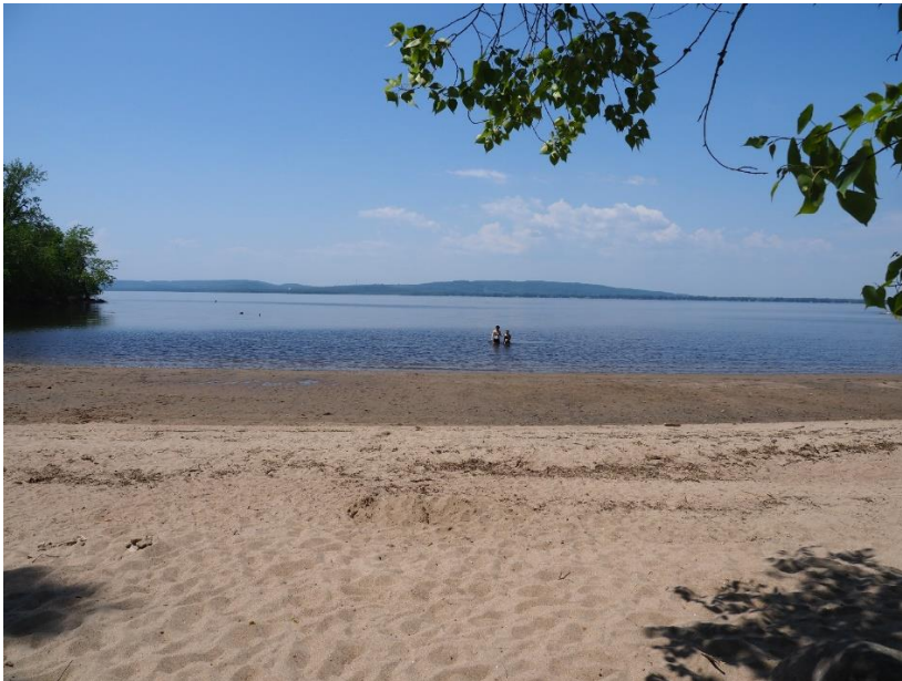
Start and finish zone view

You will need to press the sound device when you have crossed the finish line.